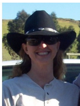
B. Haven Badly