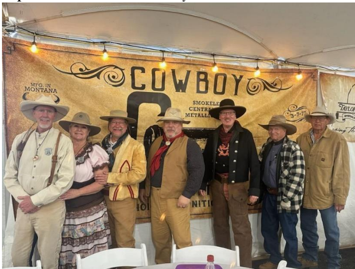
A group of Regulators ready for fame & glory!!

A great time was had at the End of Trail Cowboy Action Shooting World Championships at the Ben Avery Shooting Facility in Phoenix Arizona earlier this month. A bunch of members of the Kings River Regulators were in attendance and represented our club very well!