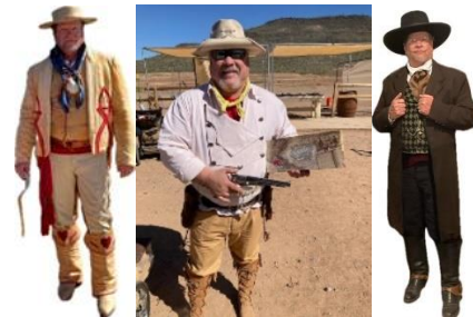
Liberty Outrider (flanked by the world's best looking cowboy) showing off one of the 1860 Army pistols he won