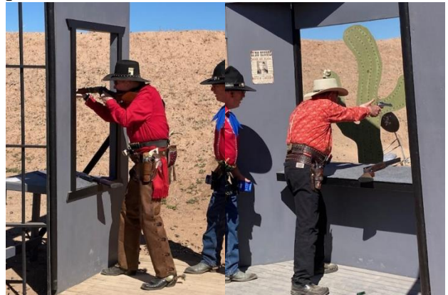
Actually Coaltrain & Snakebite aren't shooting back to back - it's photo trickery...

Sinful - 2 nd Place Senior Coyote Carson - Top Ten Forty Niner And in the looking-good category; Justice Loving - 1 st place Best Looking Cowboy (in the world!) & 2 nd Place Best Dressed Gentleman Great job Cowboys & Cowgirl! Ya done us proud!!