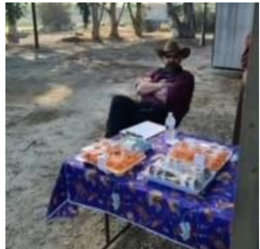
Our fearless leader is eyeing those desserts!