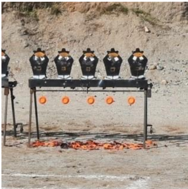
Brave Pilgrims defending the clays!