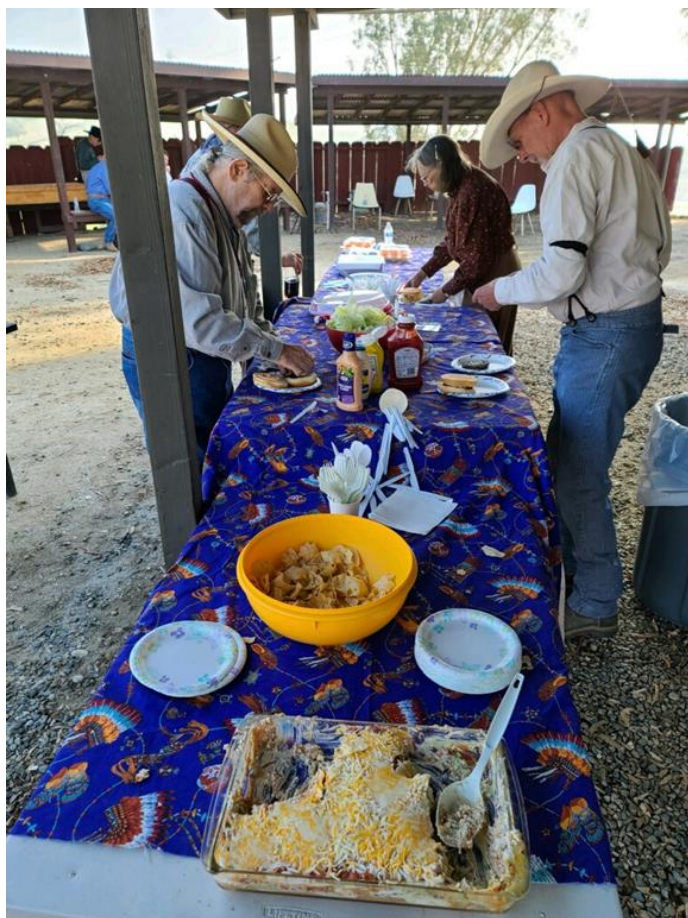
Tuolumne Tracker and Pinebox Filler arent wasting any time getting lunch!