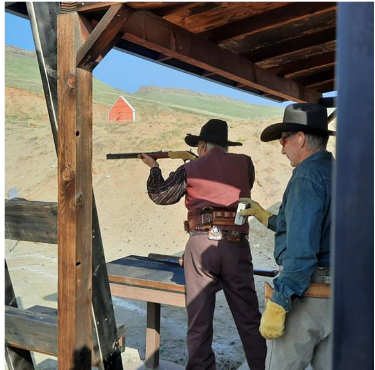
Snapshot Dualin takes aim

Alright members, it's time to step up and walk the walk! Don't miss the December monthly shoot so that you can vote.