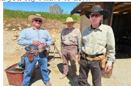
An ornery bunch to be sure