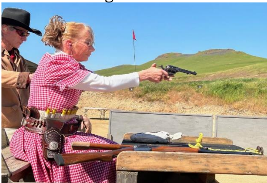
And she can shoot while driving (a wagon)!