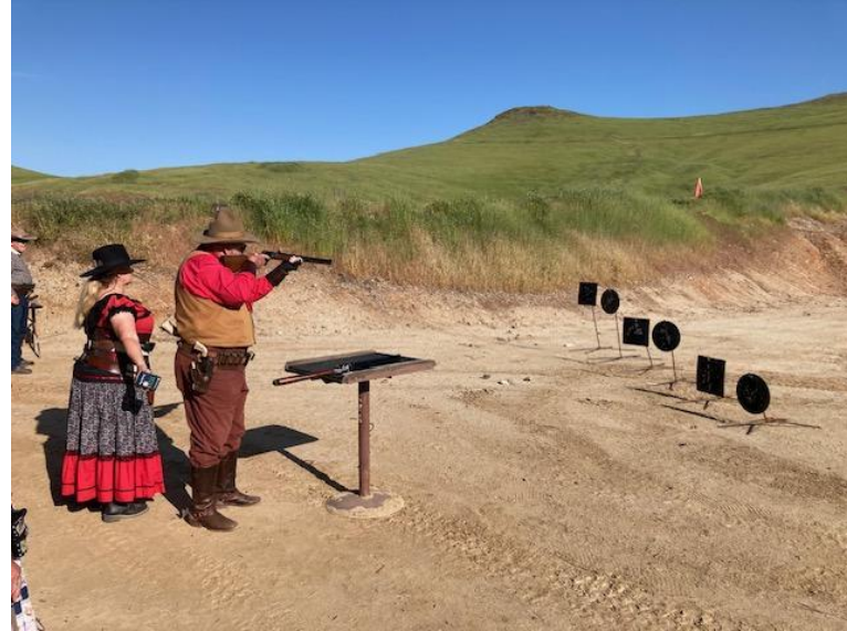
Limpin' Leroy takes out those banditos!