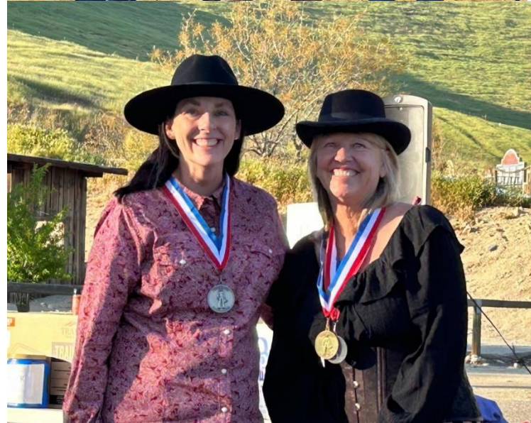
That is one gray-haired 17 year old in the middle!