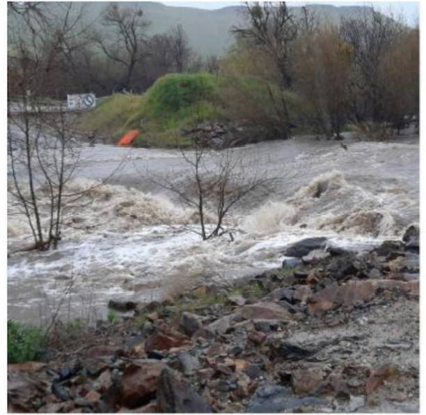
Flood Stage Over Dry Creek Bridge

tent, dinner tables, and general gathering area. With the help of a KRR weekend work party and a helpful FRPC range staff we patched the fence back together.