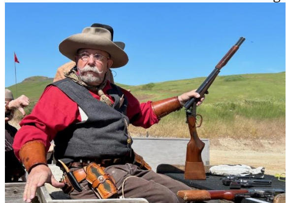
What did you say I have to do?!!