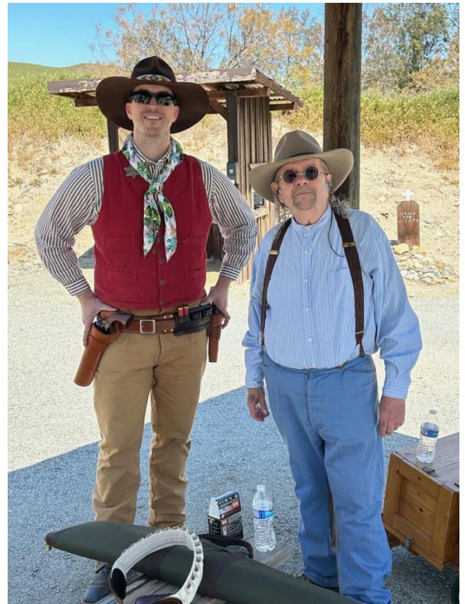
Tall Tale Todd & Tollhouse Tracker looking sharp