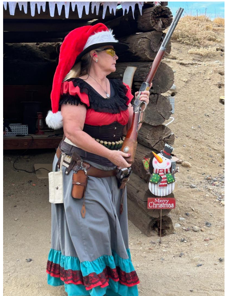
Dustbowl Debbie is ready to shoot some Christmas Spirit into ya!!