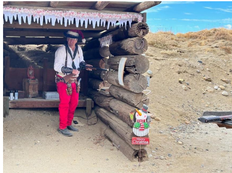
Look how festive Dutch Longhorn is looking!!