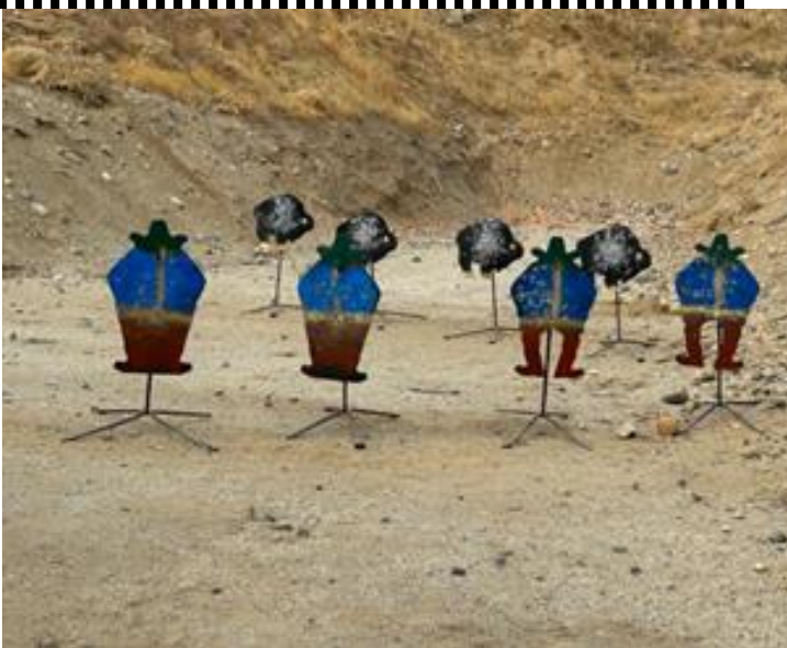
We need to talk to Dusty – he thinks these are elves and reindeer...