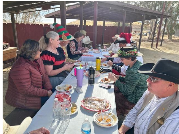
And what a feast it was!