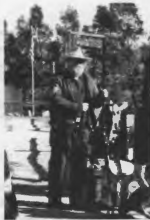
Shiloh, lookin' mighty fine!