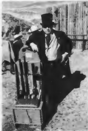
Da Judge, before he started tryin' ta do more than one thing at a time!