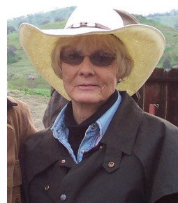
Meaner N Me