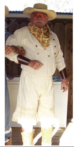
WILD CAT JOHN