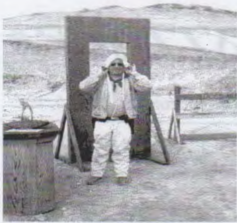
Women were scarce on the prairie. Some men did double duty.