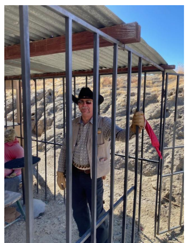
Look! Jailhouse is in, you know, the jailhouse!!

Big Bad Blaine, Mayor, KRR#324 *************