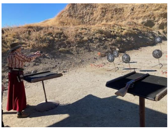
Poison Oakley throwing lead downrange