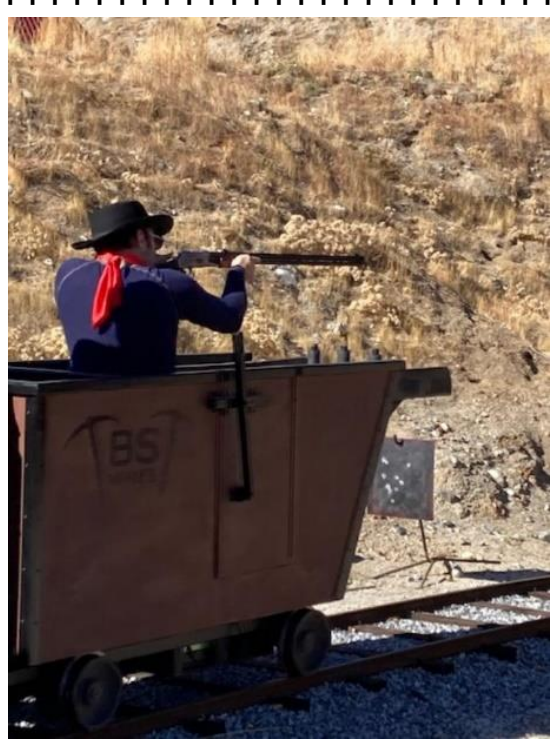
Wilhelm Scream gettin' er' done in the ore cart!!