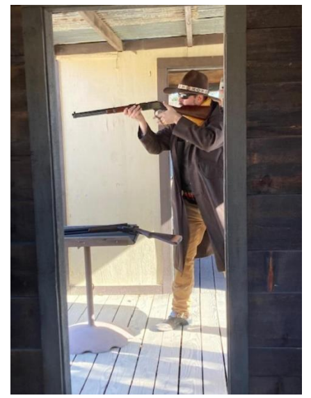
Tall Tale Todd shooting his way out!