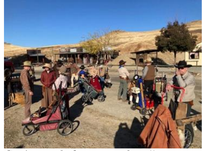
Getting ready for a great shoot!!