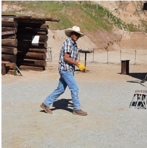
Eagle Eye Joe is ready to work!