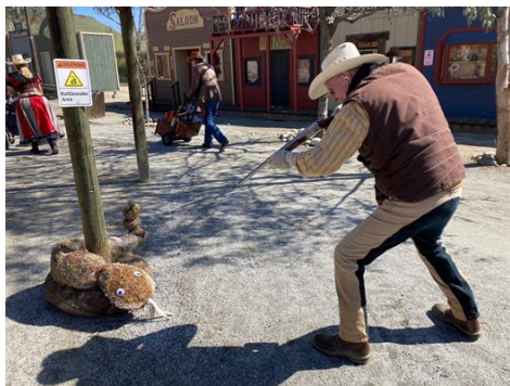
Pinebox Filler found a huge rattler!

Yes, there were snakes - lots of em'! - as well as victims lying on the ore cart tracks, popper targets and the Texas star.