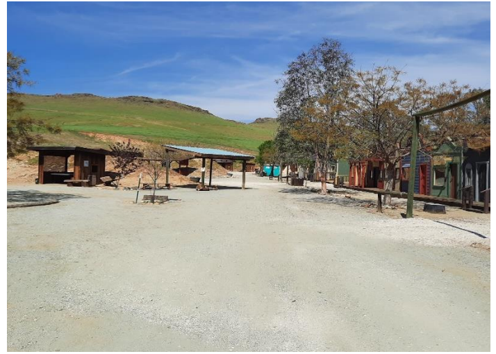
The finished product – looking good!