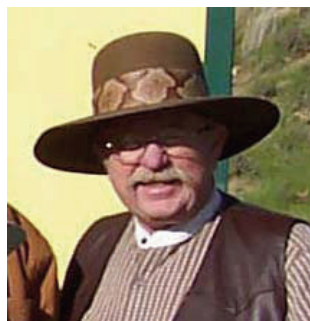
Top Shooter for 2007