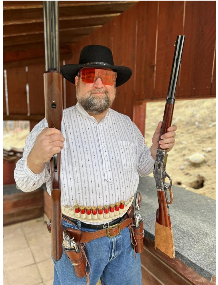
Shepherd Book is ready to go