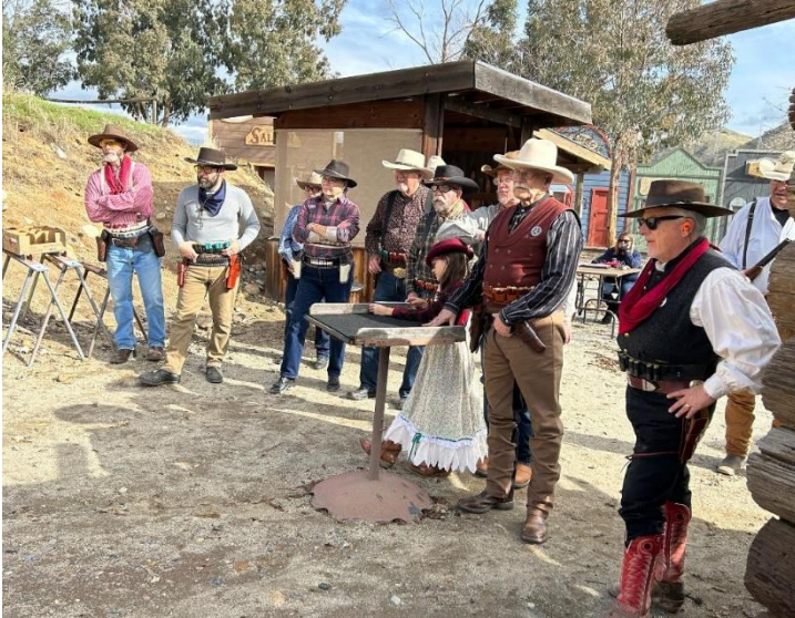
A tough looking bunch if ever I saw on!

HEY! HAVE YOU REGISTERED FOR FORT MILLER YET? WELL WHY NOT? LET'S GO!!