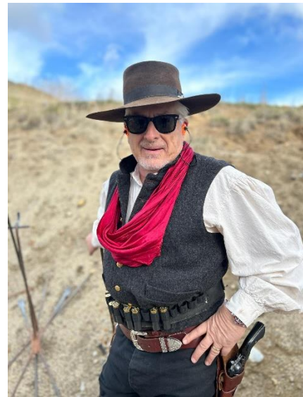
Rough, Tough, & Hard to Bluff!

HEY! HAVE YOU REGISTERED FOR FORT MILLER YET? WELL WHY NOT? LET'S GO!!