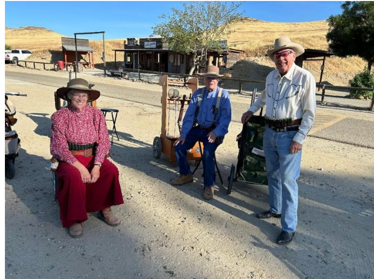
Just waitin' for the fun to start