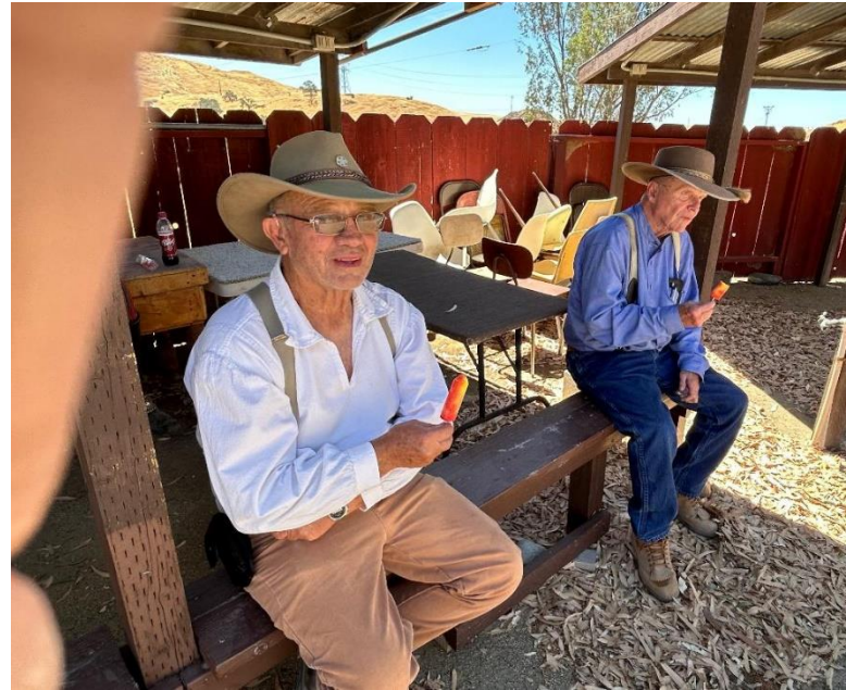
Popsicles are the best!!!