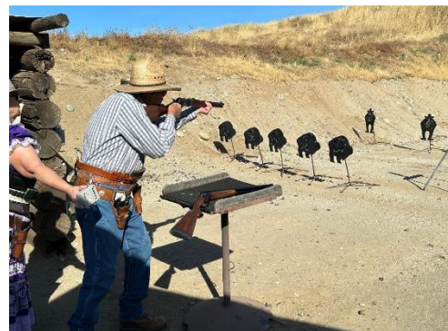
Show us how it's done!