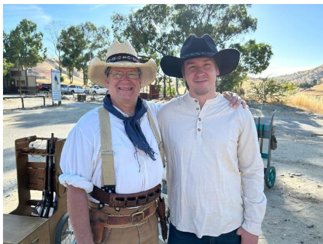
Father & Son on Father's Day