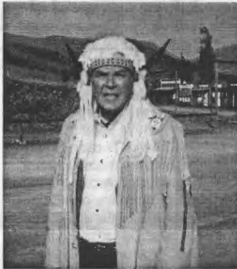
January match director and winner of the hat of the month contest.

The Loving Gang had three generations of shooters, well, par-