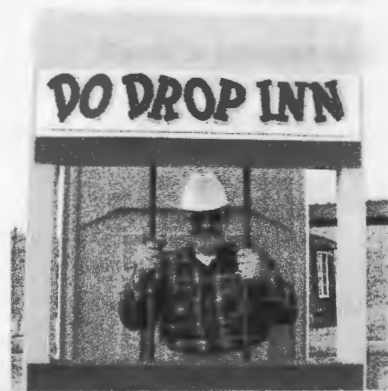
Ole' Tuolumne Lawman looks pretty good behind bars don't he!!

Volume 5 Issue 2 The official publication of the Kings River Regulators February, 2000